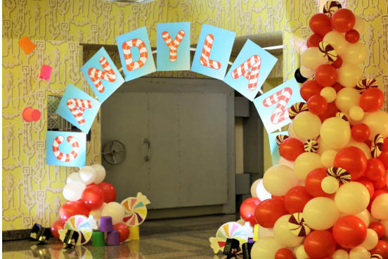
Our Opening "Candy Land" Reception & Dinner

We hope to see you again next year for our 2024 KADA Convention from June 17-19, 2024 , at Sandestin Golf & Beach Resort in Miramar Beach, Florida .