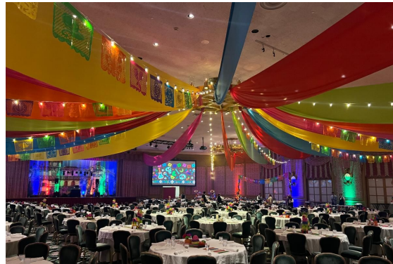
Our final "Dia de los Dealers" Party & Dinner