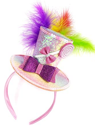
Men's costumes & accessories