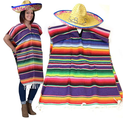
Women's costumes & accessories