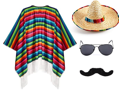
Men's costumes & accessories