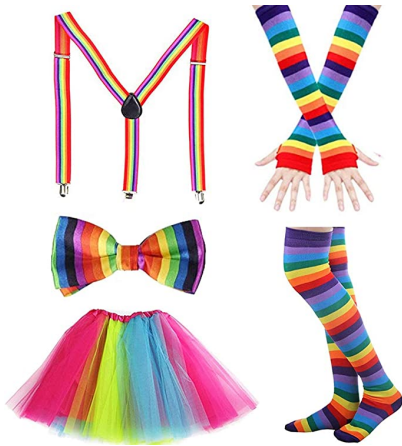
Women's costumes & accessories

The first day of Convention we'll be enjoying the opening party and dinner which will be Candy Land themed. Get inspired by the bright colors, sparkles and candy outfits/accessories that you can see in the below links: